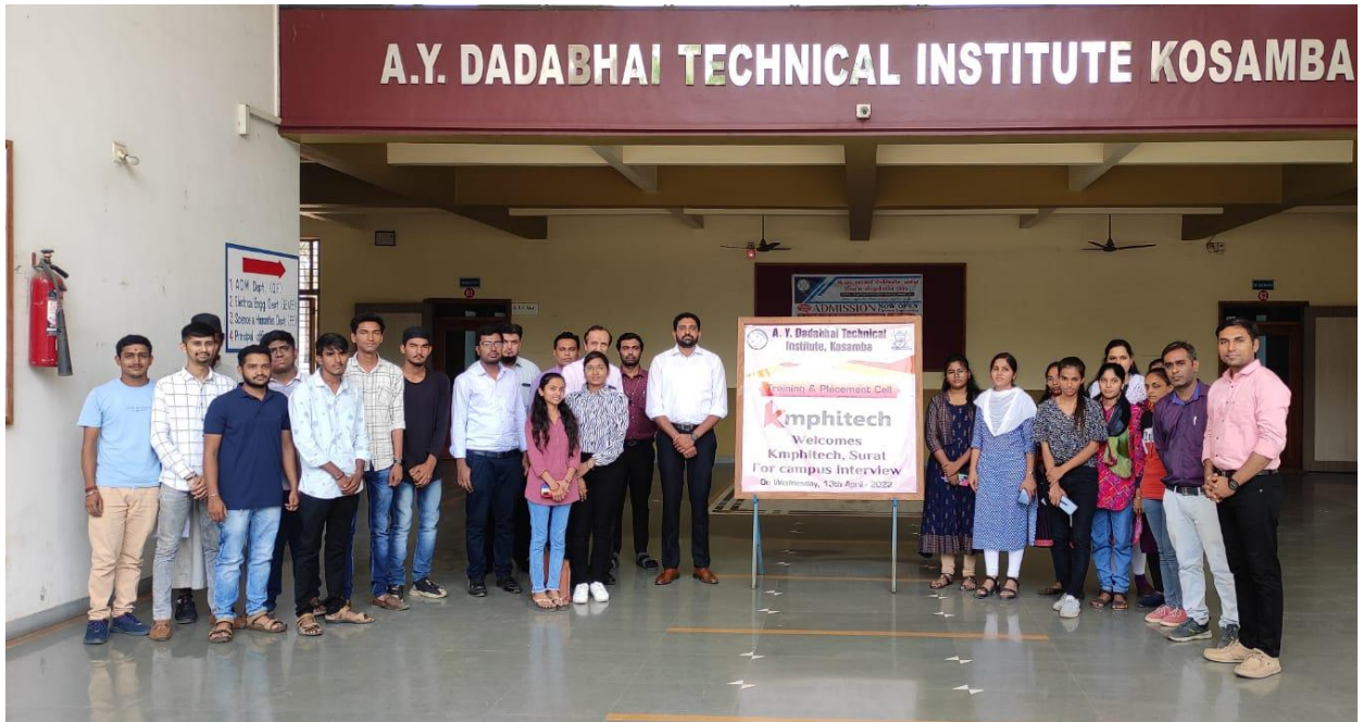
Group Photo with Company Representative