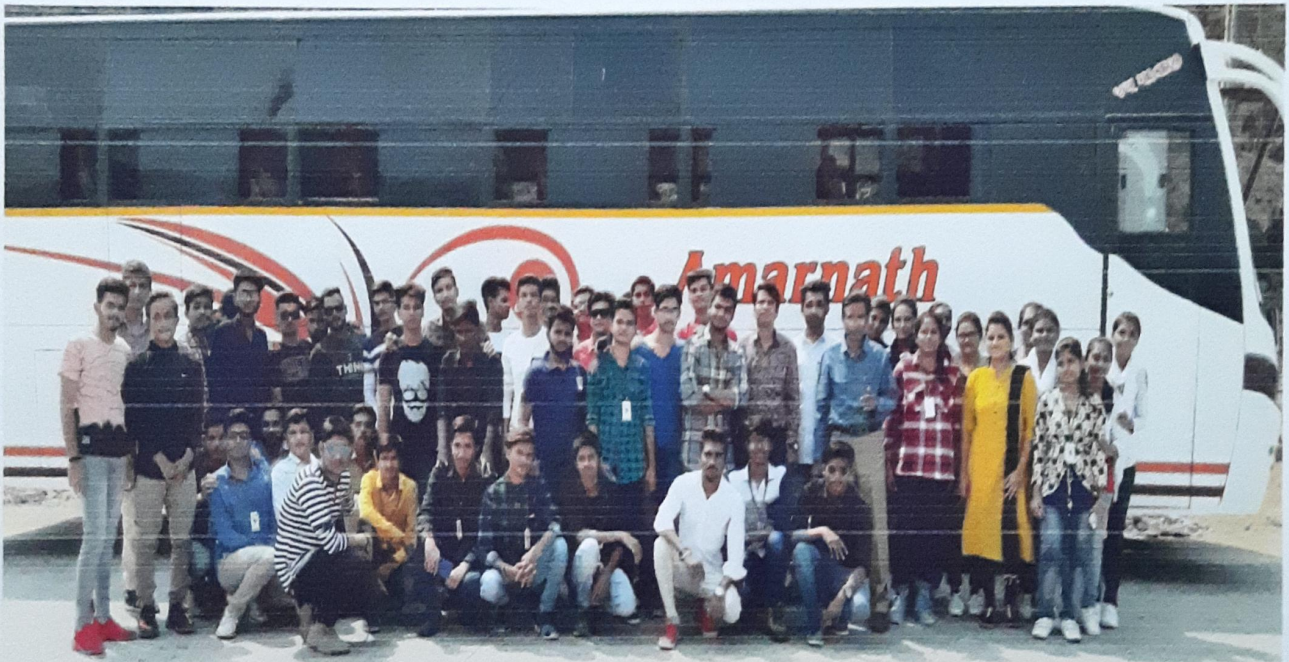
GROUP PHOTO OF (BATCH – 2016)