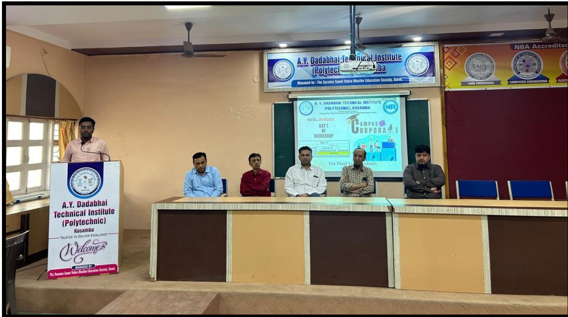
Dignitaries on the dais during program