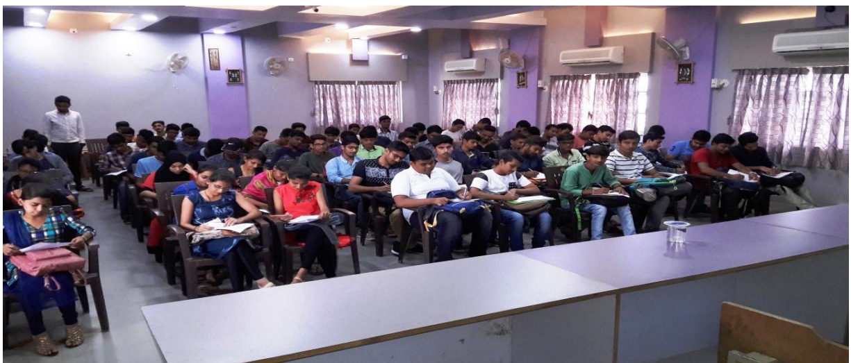
Participants filling feedback form