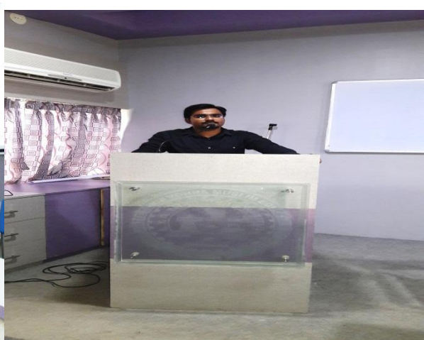
Memento Felicitation & Vote of Thanks